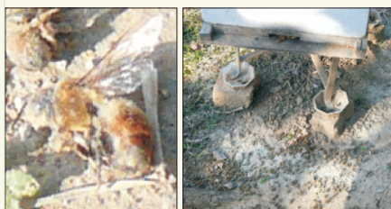
Bee with swollen abdomen