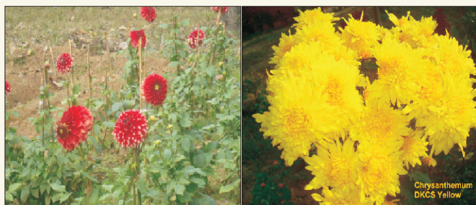
Dahlia (Giani Zail Singh) Chrysanthemum (DKCS Yellow)

dahlia; 'Maa Sharda' and 'Giani Zail Singh' produced sturdy stems (67.5cm) which can be exploited for cut flower production.