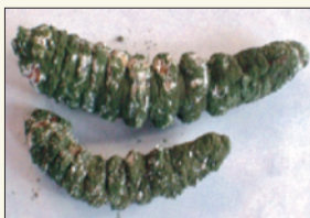
Grubs of apple root borer infected with Metarhizium anisopliae

Bio-pesticides against apple root borer, Dorystenes hugelii under field conditions: Among various biopesticide tested, Metarhizium anisopliae ( 10^6 conidia/cm 2 ) resulted in the highest grub mortality (74.4%). Other biopesticides like Beauveria bassiana ( 10^6 conidia/cm 2 ), Heterorhabditis indica and Steinernema carpocapsae (80 IJ/cm 2 each) were moderately effective against apple root borer resulting in 34.0, 45.9 and 34.9 per cent mortality, respectively.